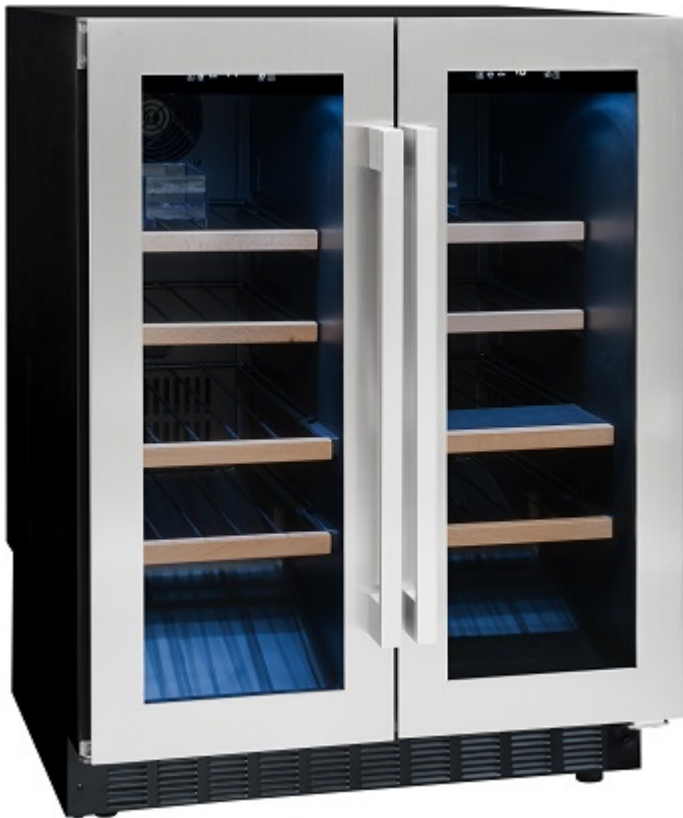
Stainless steel bottom grill